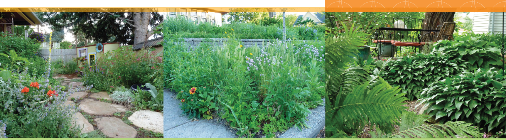
Patio, dry-adapted plants, and playhouse ^

Contact Evelyn at evelyn@lesslawn.com or 763-559-6518 to discuss scheduling an event. You can also find more information at LessLawn.com (click on Evelyn's photo for speaker details).